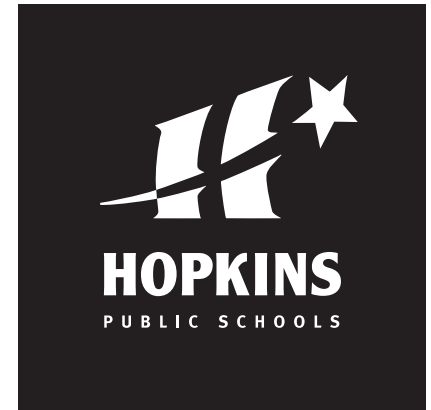
Black - Square Format